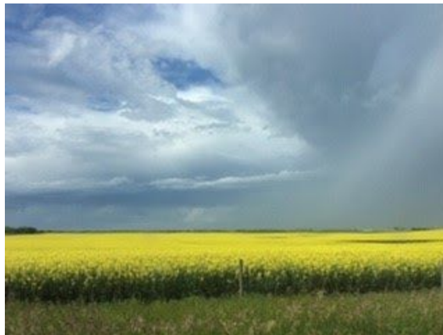
Photo of Canola fields, AB, used with permission.