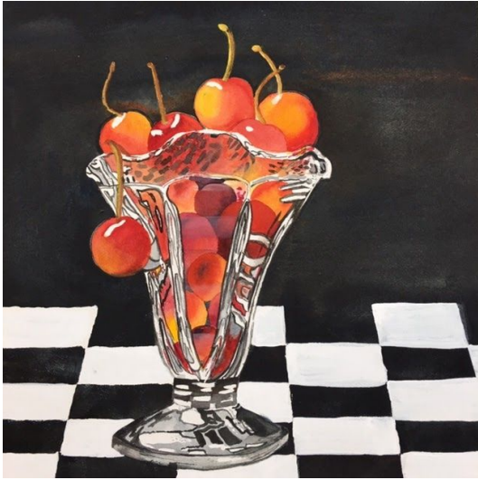
Sandy Greer's cherries look good enough to eat!