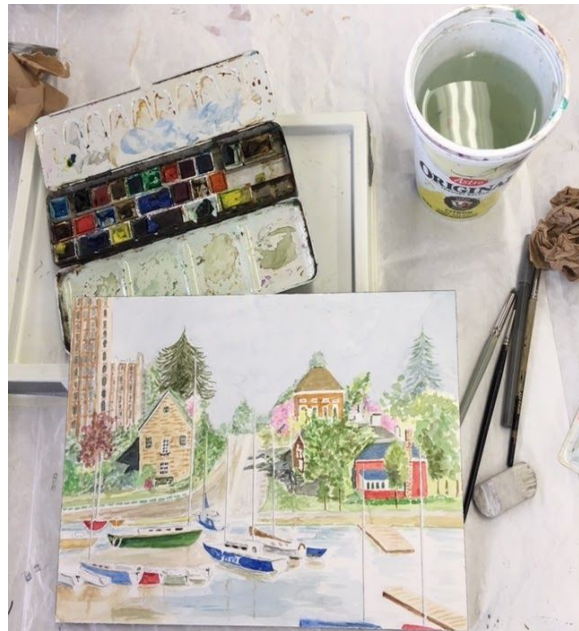
Minna Sturup's watercolour of Oakville Harbour, looking up the hill on Water Street.