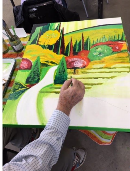
Franz Opferkuch's colourful landscape for a friend.